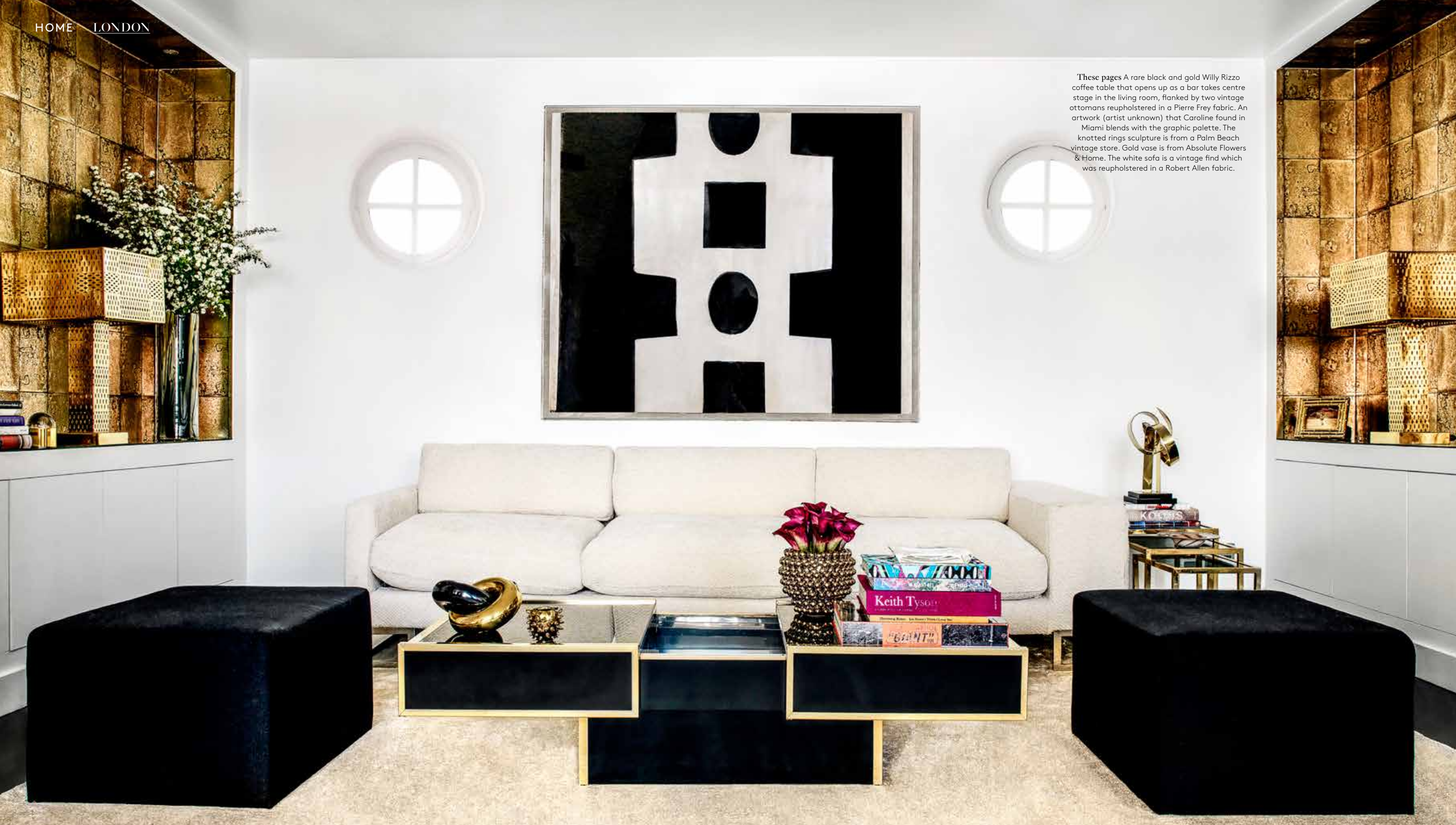
"I was looking for that glam look that echoed my style and the